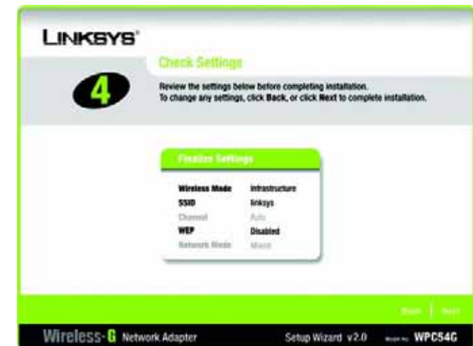
Figure 4-7: The Setup Wizard's Check Settings Screen